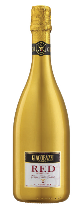
GIACOBAZZI RED GOLD EDITION