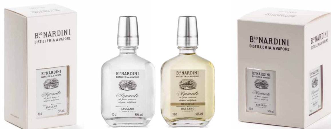
2-PACK 10 cl assorted pocket-sized.