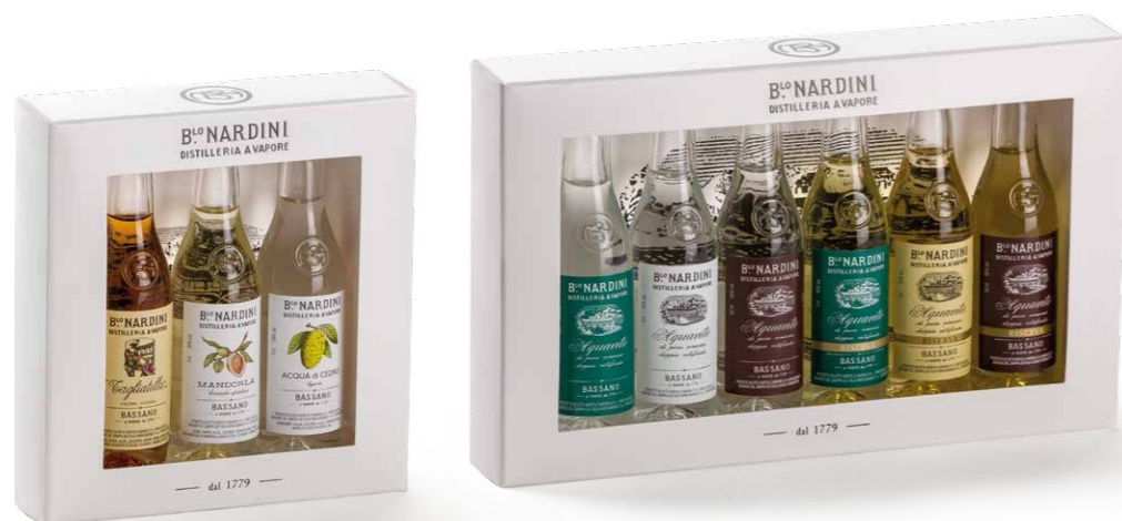
3 OR 6-PACK ASSORTED MINIS, 3 CL